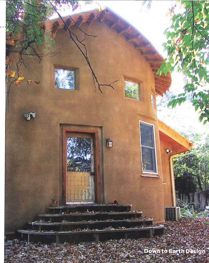
Down to Earth Design

grand windows to bring surrounding landscapes inside homes (bottom right). Examples of the firm's work range from small—simple deck additions—to massive—a 9,000-square-foot, S-shaped, radiant-heated estate in the Great Smoky Mountains. But the finest testament to Macht's talents might be his own woody, restored cottage beside a beautifully renovated chicken coop that serves as the group's office. 1231 School Lane, Rydal, 215-572-7511, machtarchitects.com.