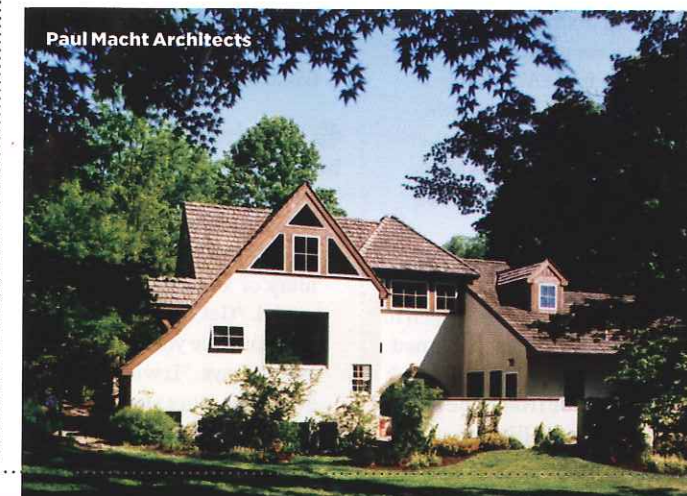
Paul Macht Architects

green? The remodelers at Buckminster Green (484-432-2692, buckminstergreen.com) specialize in the low-profile-but-makes-a-diff things like energy-efficient windows, FSC-certified doors, and no-formaldehyde insulation. Greensaw Design & Build (215-779-4489, greensawdesign.com) carpenters perfectly fit houses with architectural salvage finds (see "Saved!" on page 64). Thirty-plus-years-in-the-biz Sunpower Builders (610-489-1105, sunpowerbuilders.com) makes running your whole house on the sun's wattage less of a crazy futuristic concept and more about lowering your next energy bill by as much as 95 percent. Since moving here from San Francisco in 2006 to form K Group (215-849-2001, kgroupphilly.com), Alex Keating has installed custom formaldehyde-free millwork in a Wynnewood home, renovated a Rittenhouse kitchen with Plyboo, PaperStone and IceStone, and greenly tackled serious structural jobs. At Mt. Airy's 7-year-old Stock Group (215-510-0647, thestockgroup.net), specialties are radiant heating, high-efficiency plumbing, renewable finishes and green roofs.