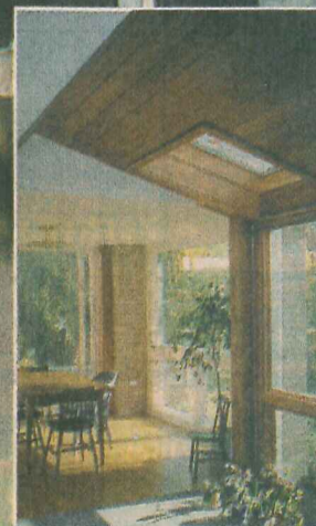
Behind: addition blends in with exterior of the home, while above: glass and design bring backyard into the interior, providing an airy feel.

Large areas of glass, a skylight over the garden bed, and suspended book shelving in the study niche further reinforce an airy, outdoor feeling. Both areas are warmed by a direct vent gas fireplace as well as solar collection in the flagstone flooring. Some of the flagstones from the old patio are used inside the house.